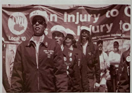
The union's drill team leads the San Francisco May Day march

As they wrote in a solidarity letter to ILWU members: "The courageous decision you made to carry out a strike on May Day to protest against the war and occupation of Iraq advances our struggle against occupation to bring a better future for us and for the rest of the world as well. We are certain that a better world will only be created by the workers and