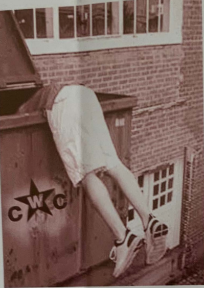
Despite much searching Siobhan could find no evidence of partnership being good for her

The average difference is £6.05 an hour for women and €3.43 an hour for men.