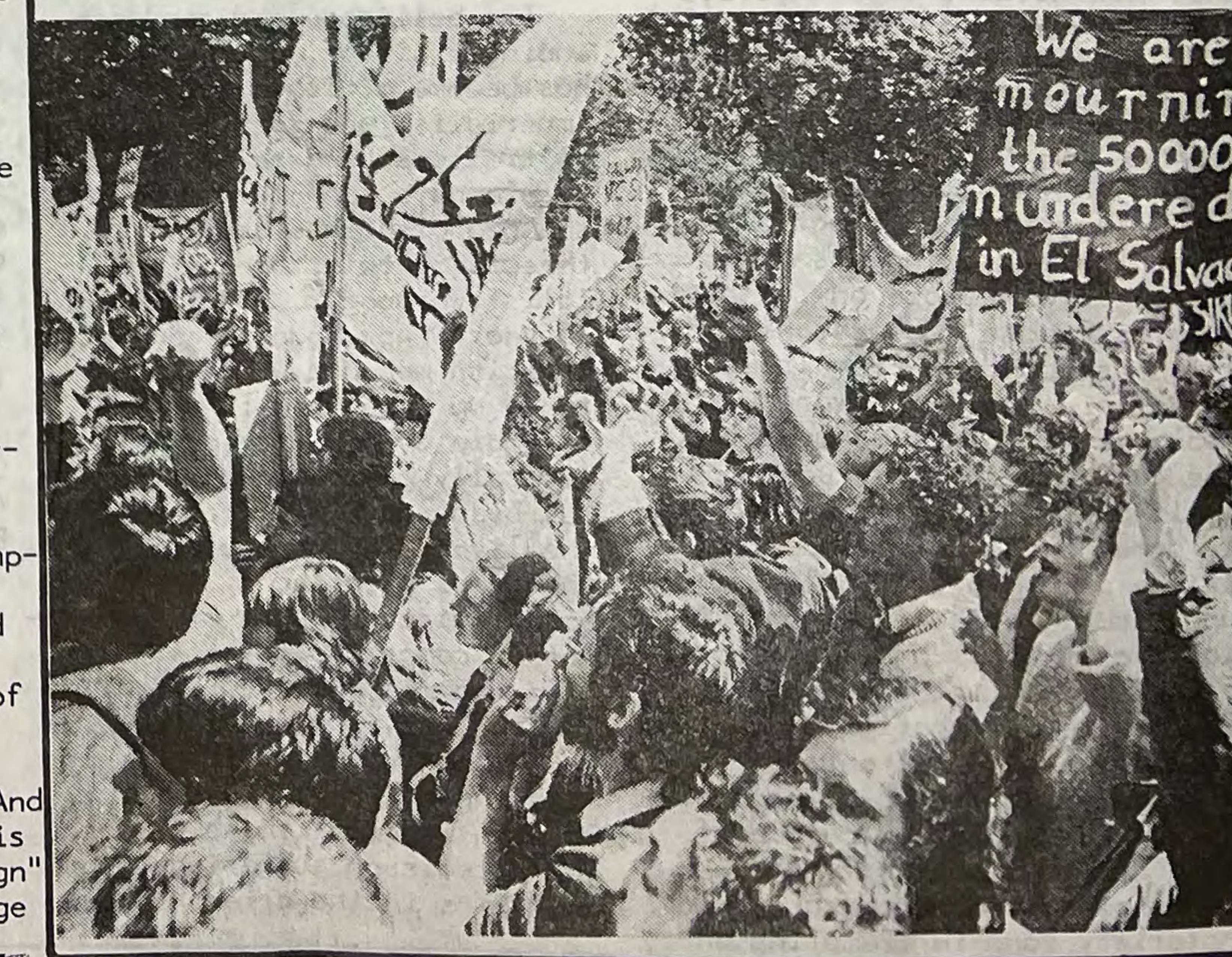
PHOTO ABOVE shows powerful protest in Dublin. PHOTO BELOW shows people in Galway denouncing Reagan as his motorcade passed

The mass demonstrations acquired increasing militancy and mobilised democratic people of all ages, but especially the youth. The oppressive state forces did everything to keep the people away from Reagan, but could do nothing to suppress the hatred of the Irish people against the imperialist warmonger.