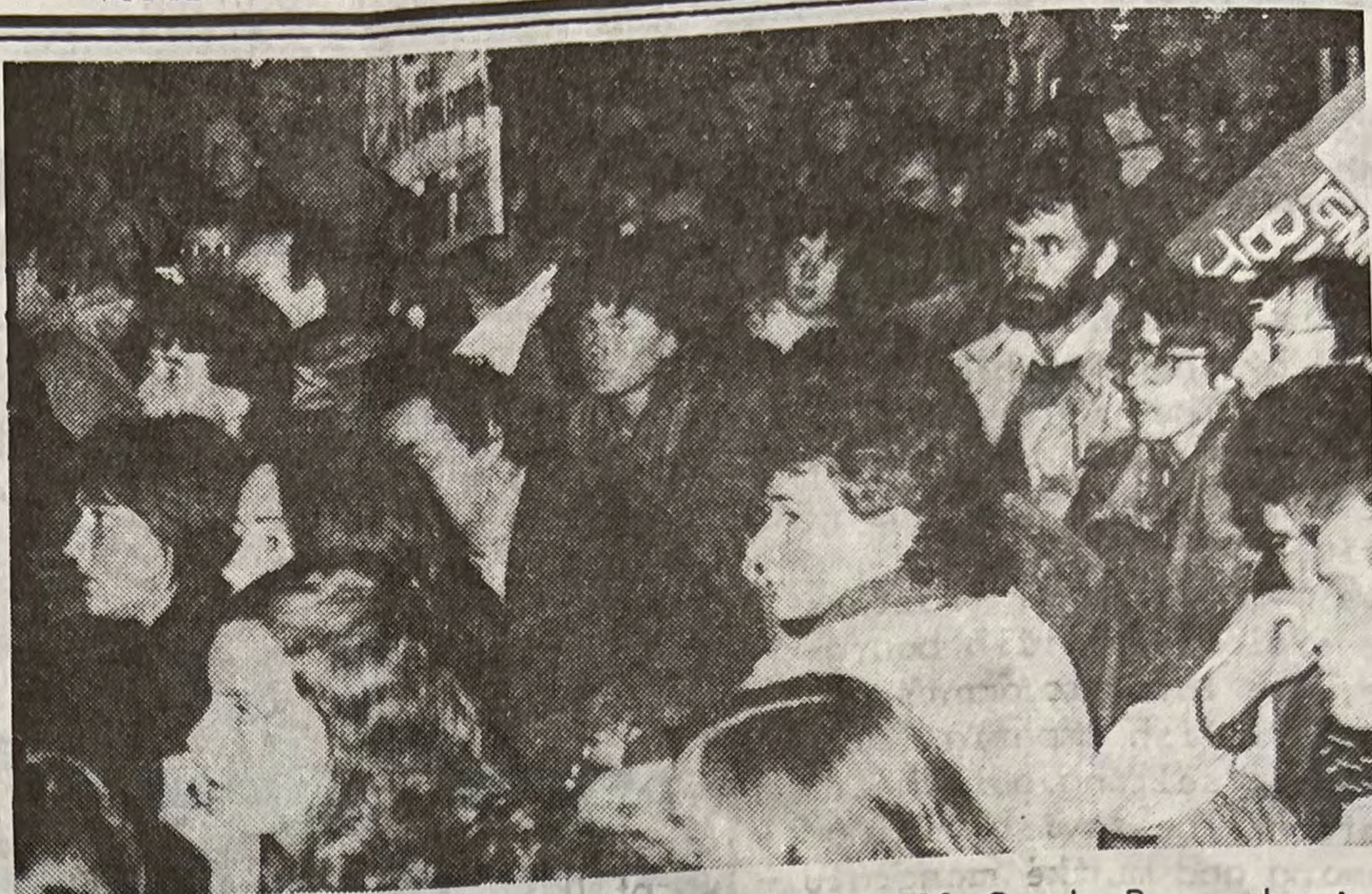
Section of mass picket outside Bridewell Garda Barracks in protest against unjust arrest of over 30 women, who had been exercising their democratic rights to condemn Reagan. The demonstration of some 500 people then proceeded to Store St. Garda Station to protest over the arrest of 2 students, who had also been manhandled by the Gardai.

Even the national traitors assembled in the joint session of the Oireachtas could not disguise their growing dismay or manage to dissemble any enthusiasm as Reagan's anachronistic threat skipped on from Ireland to take in the whole world. The applause for his condemnation of the just patriotic struggle in Ireland died out entirely when it came to the same condemnation of the people of El Salvador and Nicaragua and the megalomaniac declamations against the rival imperialist superpower, Soviet social imperialism. But this dismay was not out of any regard to justice or principle. For in damning the struggle of such distant peoples, whose oppression is a matter of world notoriety, and in trampling on