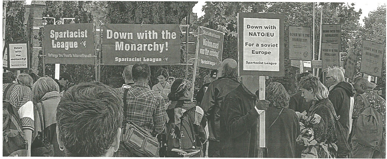
19 September: Rally in Windrush Square, Brixton, on day of Elizabeth II's funeral.

Our main speaker denounced "the monarchy and the United Kingdom" as "a prison for Scotland, Wales and Northern Ireland's Catholics" and King Charles III as the "colonel-inchief of the brutal Parachute Regiment that shot and killed 14 people on Bloody Sunday in Derry in 1972". She hammered on the urgency of workers opposing the monarchy, taking power and running the country.