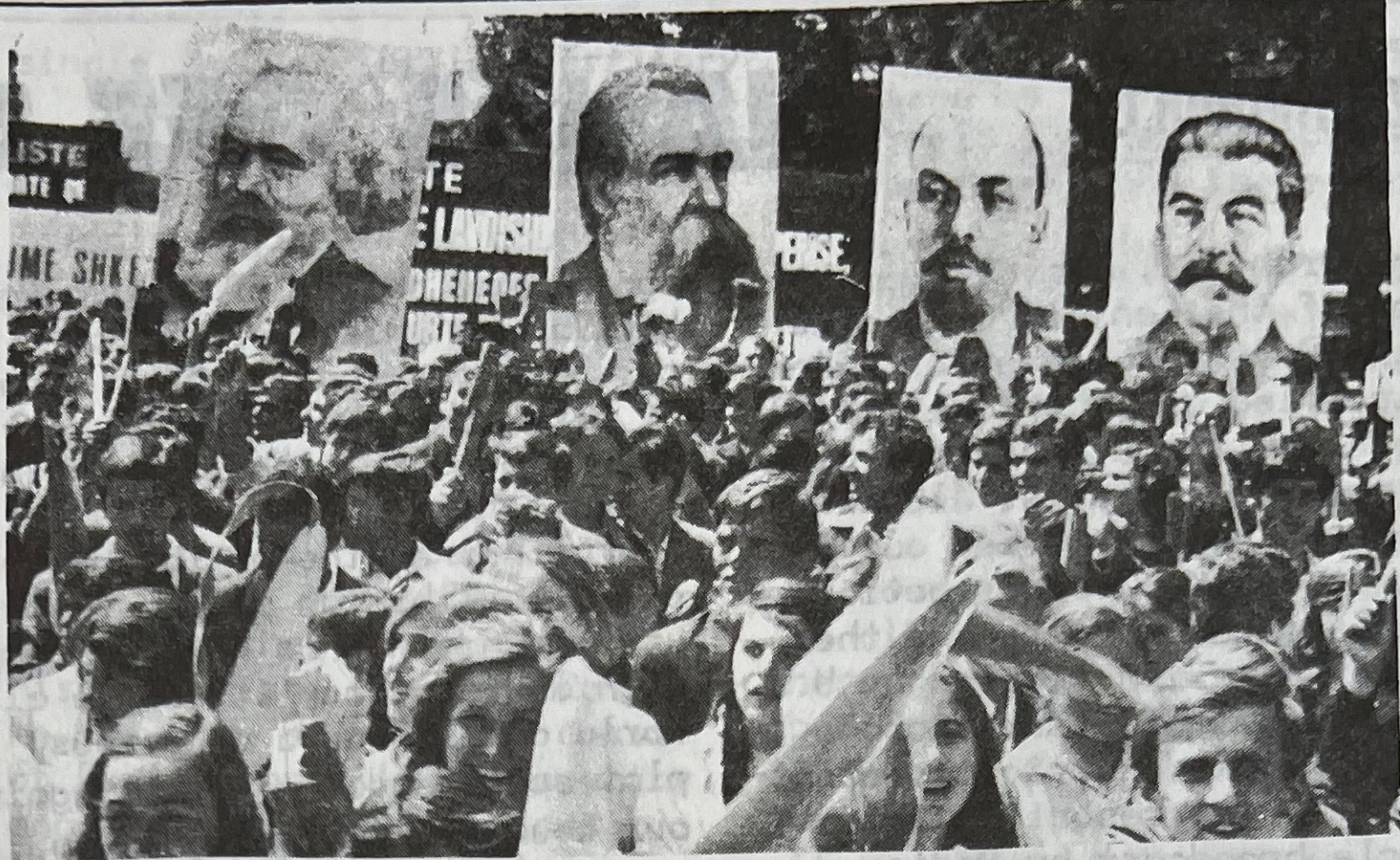
MAY DAY IN PEOPLE'S SOCIALIST REPUBLIC OF ALBANIA

It is in this context that the watchword of James Connolly, the great patriotic martyr and militant organiser of the Irish working class, must be our watch-