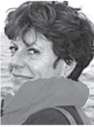
The Dutch Commissioner Neelie Kroes-Smit sat on the boards of twelve major companies including Volvo and the French arms group Thales. She also worked as a lobbyist for Lockheed Martin, the US arms manufacturer.

plays a huge role. This unelected body has the sole right to propose laws to an elected body. Article 249 b gives more 'delegated powers' to the EU Commission to ' supplement or amend certain non-essential elements of the legislative act '.