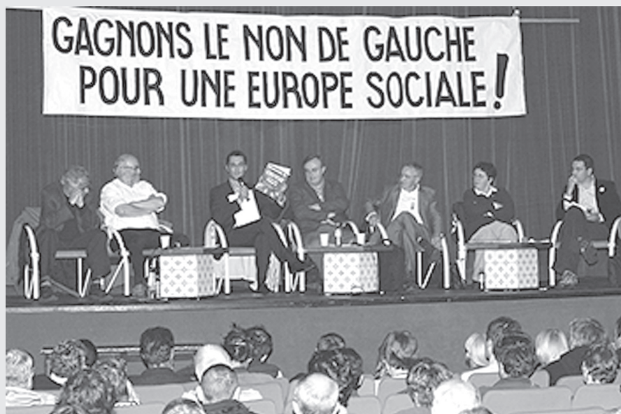
Another in Brest