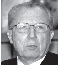
Delors used his credentials as a 'christian socialist' and a former union activist to woo leaders of the European Trade Union Confederation

port the de-politicisation of economic relations ... and do away with restrictions on the movement of capital, labour and commodities.