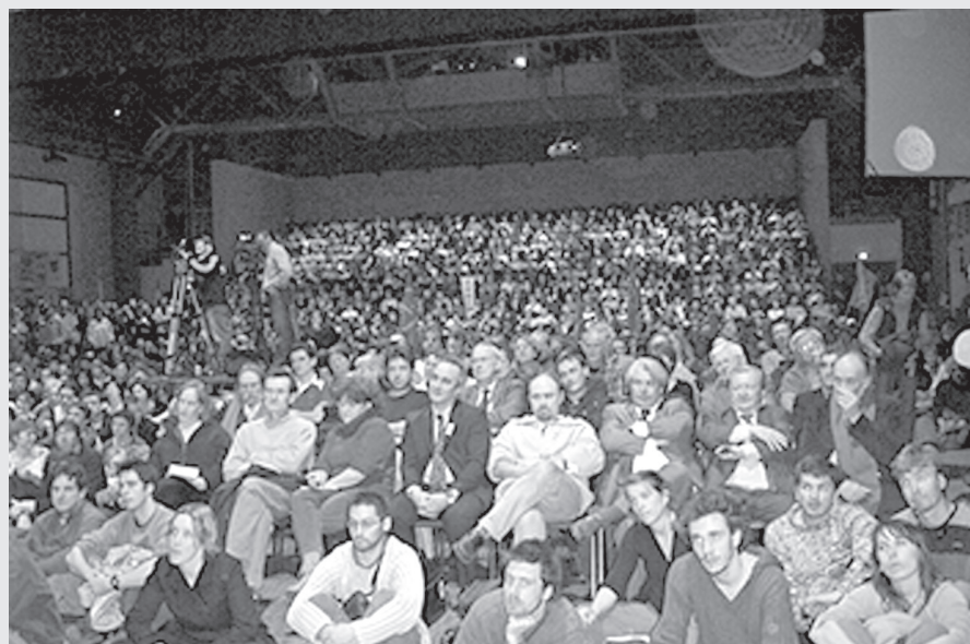
Massive Vote No meeting in Grenoble