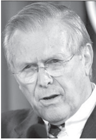
in September 2002, the US Secretary of State, Donald Rumsfeld, announced that a NATO Response Force would be established

fence' – but, probably, only for the moment.