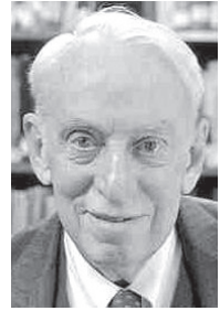
US economist James Tobin who proposed a 0.25% tax on all currency transactions.

The EU has developed its own special jargon for public services, which are known as either ' services of general interest ' or ' services of general economic interest '. Both terms cover services such as water, electricity supply, waste disposal, health care, social housing provision or education. The distinction between the two cat-