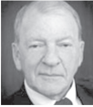
The driving force was Pehr Gyllenhammar, the CEO of the car manufacturer Volvo, who brought the business leaders together

progressive outlook to Ireland. Many of the laws which advanced the status of women or outlawed discrimination originated in the EU. In the 1960s, many firms in Europe wanted to draw women into the workforce during a long boom and so they accepted the idea of equal pay. From the standpoint of a church ridden society, the EU looked like guarantor of liberal progress. But this was not always the case. For example, a protocol was added to the 1992 Maastricht Treaty that prevented Irish women from using any aspect of EU law to gain information or access to abortion facilities. Rights to information on abortion had to be won by Irish people themselves. Following the X-case in 1992, marches and protests forced the Irish state to allow 14 year old rape victim to travel to Britain for an abortion.