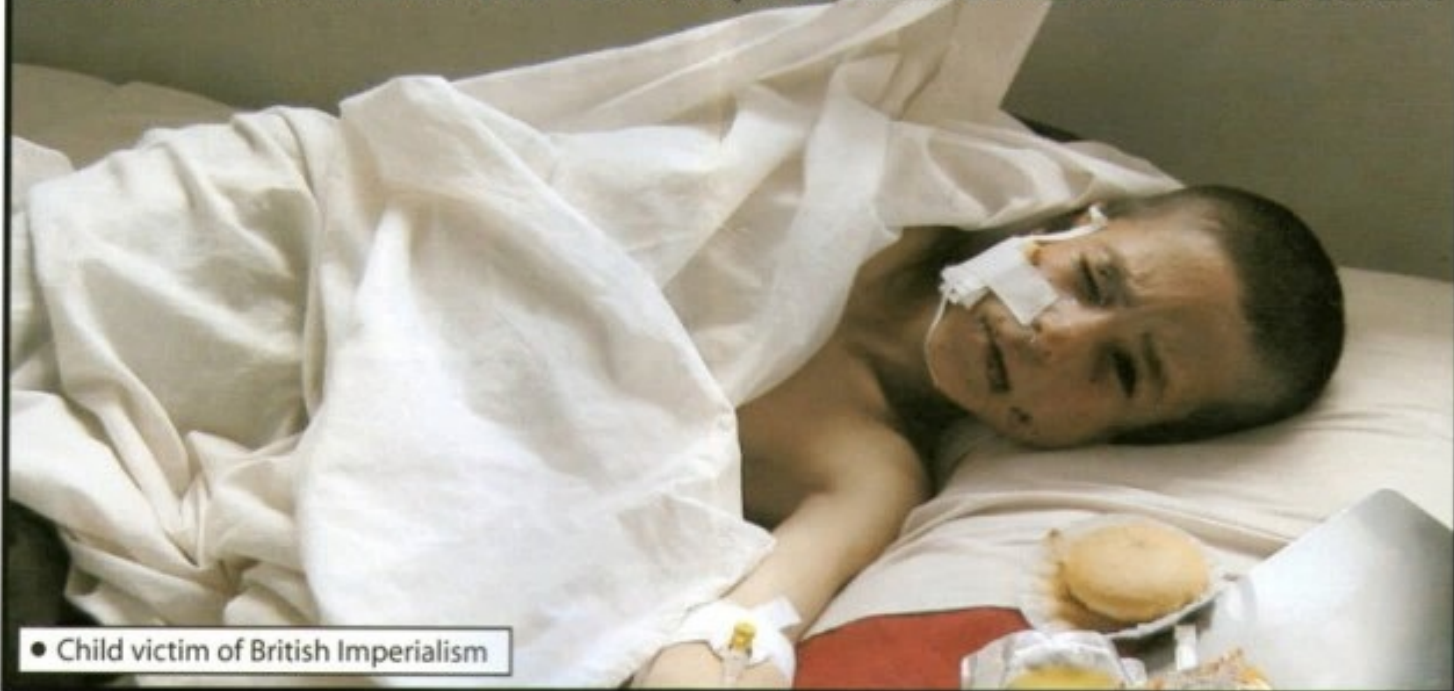
• Child victim of British Imperialism

The British Army has a long and bloody record of imperial occupation across the globe. In recent years the people of Iraq and Afghanistan have been subjected to the terror of Elizabeth Windsor's army of occupation.