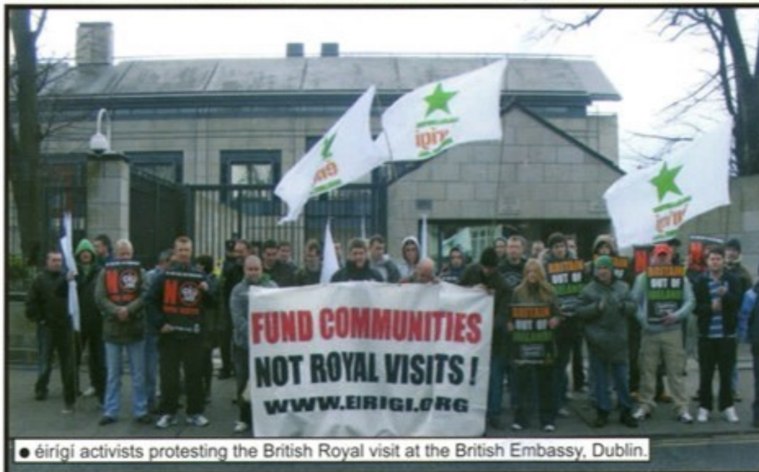
● éirigi activists protesting the British Royal visit at the British Embassy, Dublin.

The new Fine Gael led government has declared its intention to continue the failed policies of their first cousins in Fianna Fáil. They intend imposing further savage cuts and privatising vital public services. Settling the gambling debts of private banks with public money is set to continue.