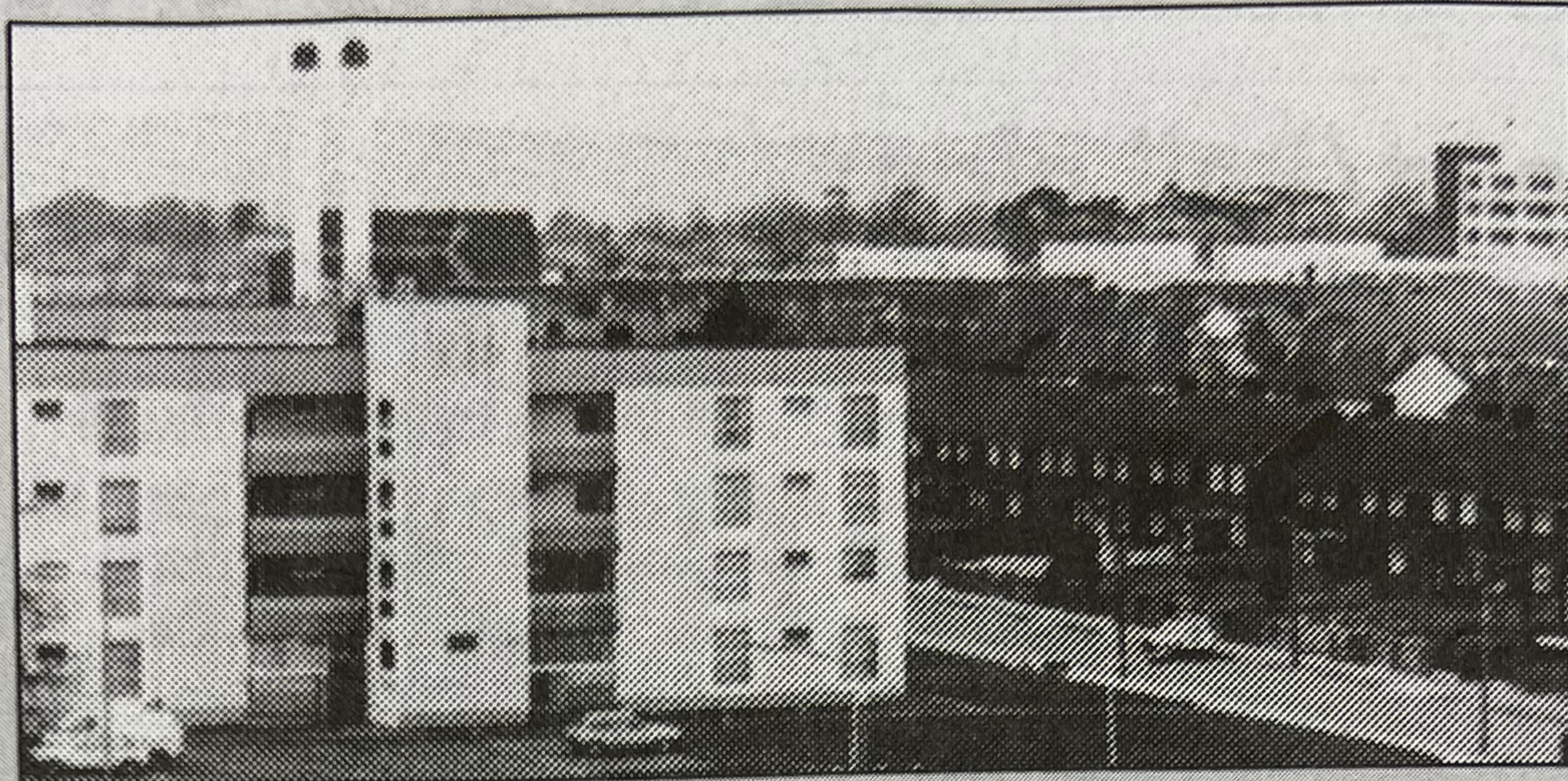
Beaumont Hospital peers out over Kilmore West

Some years ago, a report by the Free Press on industrial chemical pollution in Coolock caused major ructions. The next threat to public health on the northside was posed by dioxin emissions from Beaumont Hospital's waste incinerator. The Free Press discovered an internal Health Board report that Coolock-Artane had one of the highest adult mortality rates in the country. At the time, action by Pat McCartan of Democratic Left had the incinerator closed down.