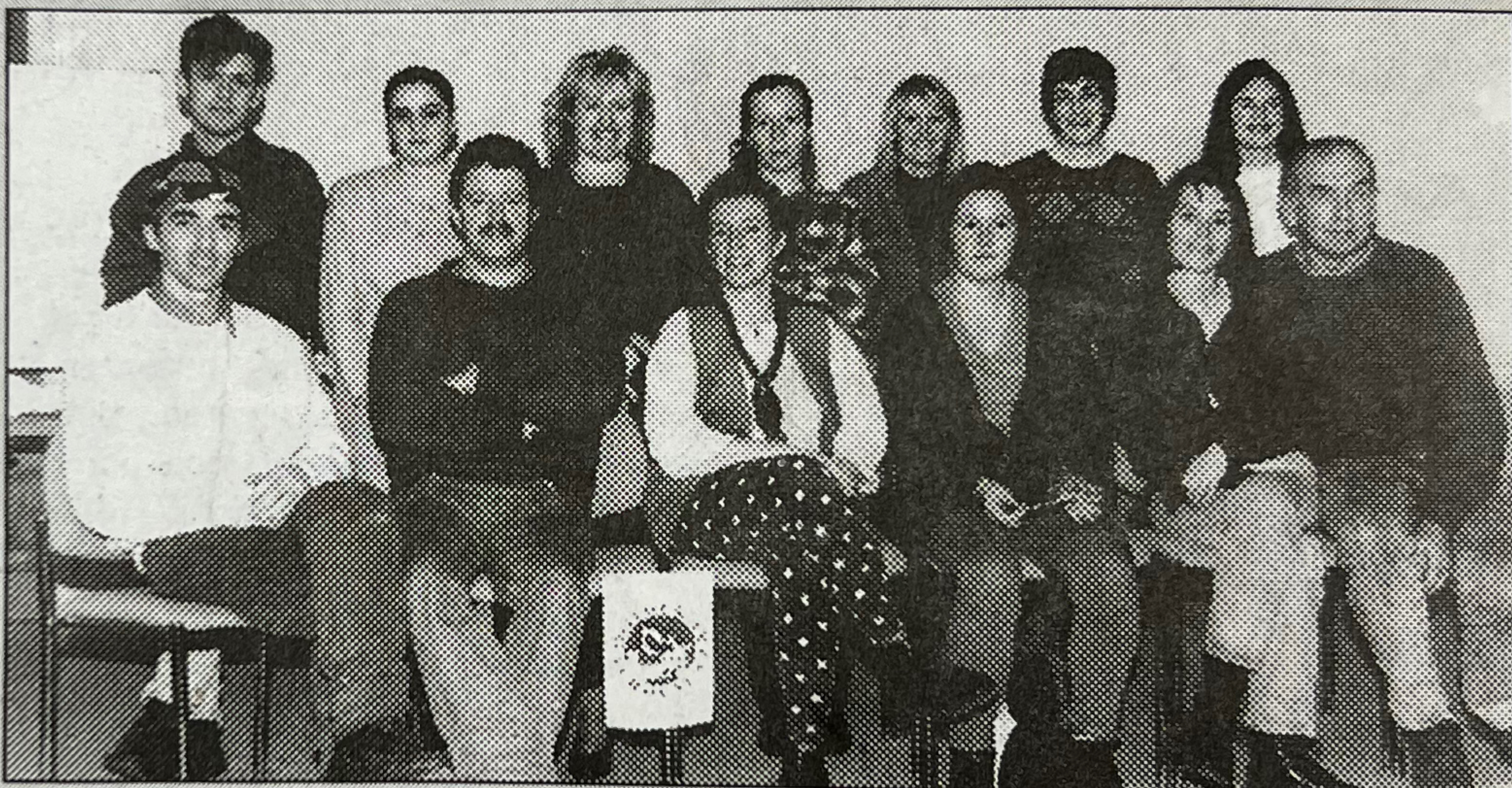
Some of the Coolock Art House workers