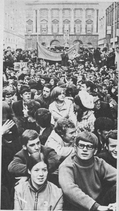
26 Members of PD stage a sit-down strike outside the City Hall at the start of the Civil Rights Campaign in October 9, 1968.