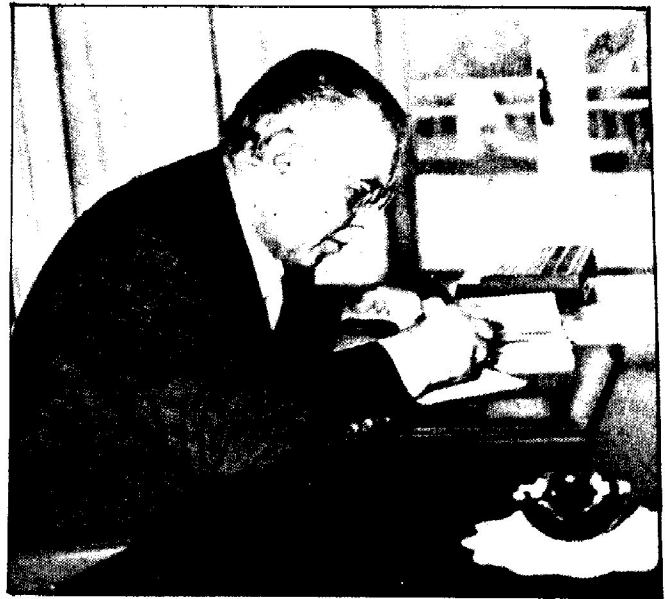
Enver Hoxha, First Secretary of the Central Committee of the Party of Labour of Albania.

Comrade Enver Hoxha denounces powerfully and all-sidedly the hostile, anti-Arab and expansionist policy of Israel and international Zionism. The